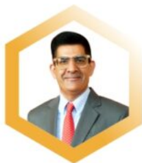
Safir Anand Trade Mark Star 2024